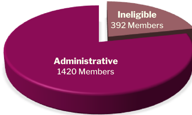
Coverage Ended (Administrative - 1420)

Members whose coverage ended in January 2024