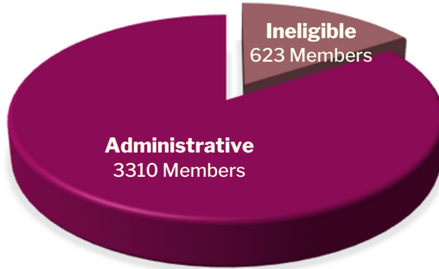
Coverage Ended (Administrative - 3310)

Members whose coverage ended in September 2023