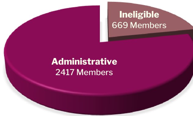
Coverage Ended (Administrative - 2417)

Members whose coverage ended in August 2023